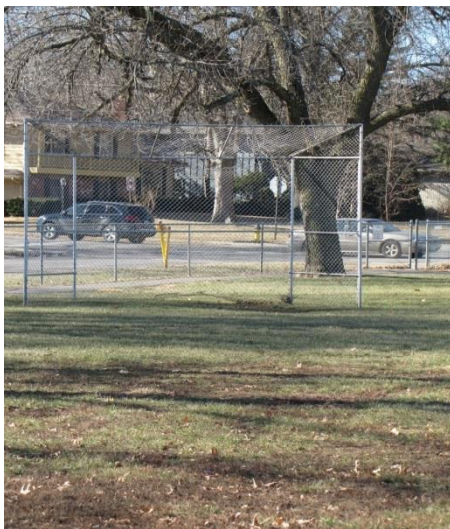
Image 3: The backstop provides residents with opportunities to hold practices and unorganized games.