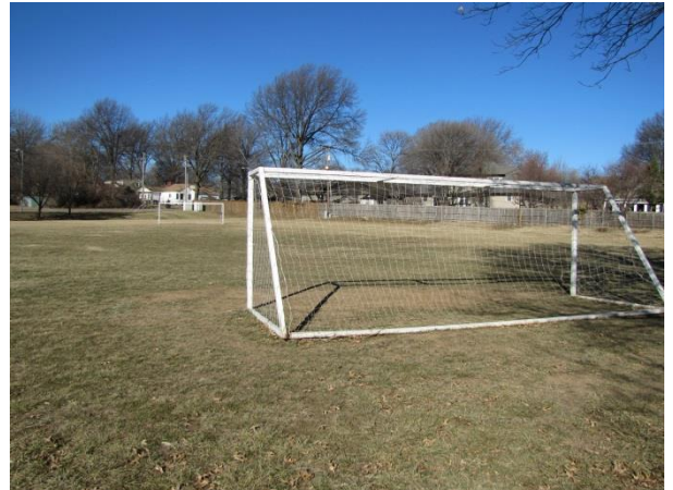
Image 2: The open play field provides a good location for local residents in the surrounding neighborhood to hold practices and gatherings.