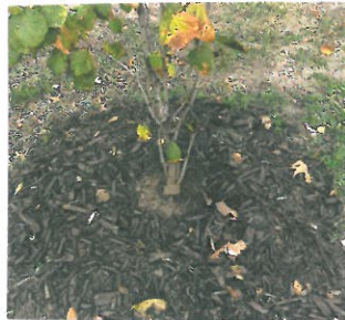
Properly mulched 3 inches from trunk, deeper at edges