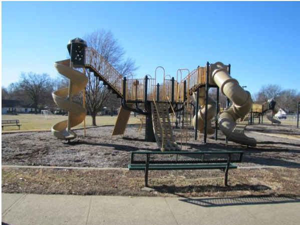
Image 1: Playgrounds and surfacing are in need of replacement to meet current ADA standards.