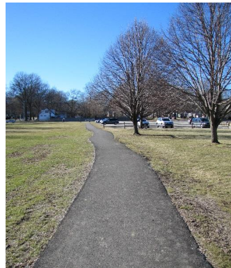
Image 4: The perimeter asphalt walking trail was replaced in 2015.