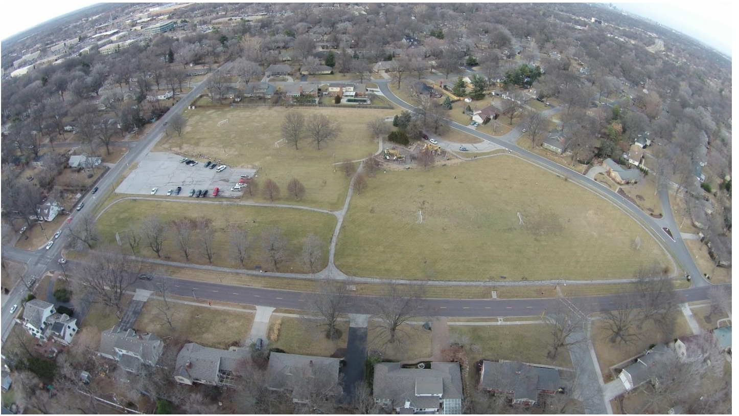
Image 5: Mohawk Park remains relatively undeveloped and provides a good location for local teams to practice.