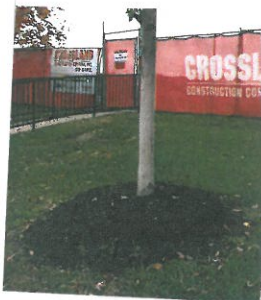
NO Volcano mulching- highest at trunk